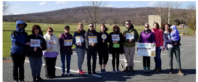
Below: 2018 National Move More Walk at Deer Path Park in Flemington

Companies interested in joining the Healthy Hunterdon Workforce Initiative should call 908-782-7115 or visit https://www.hunterdon-chamber.org/healthy-hunterdon-workforce.html .