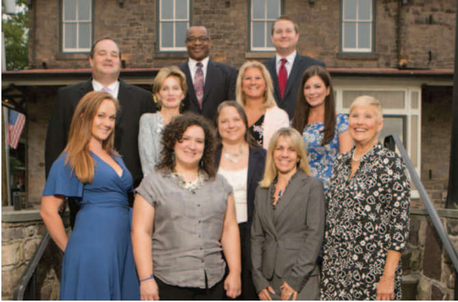
The 2019 Leadership Hunterdon Class is: