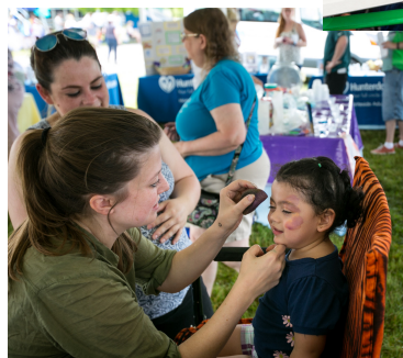
Pictured: Hunterdon Healthcare offered face painting and other activities inside their tent