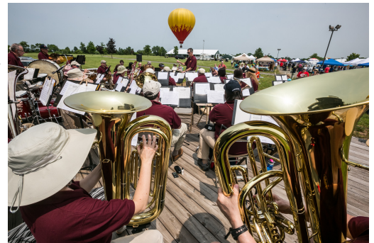
Pictured: The Whitehouse Wind Symphony performing live as the Unity Bank Balloon soars in the distance