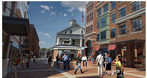
Proposed Rendering of Courthouse Square Flemington, Plaza View of Courthouse, Credit Minno & Wasko Architects and Planners

The Hunterdon County Chamber of Commerce Business and Government Committee has taken a position of support for the Courthouse Square Project. For more information about the project, visit www.courhousesquareflemington.com .