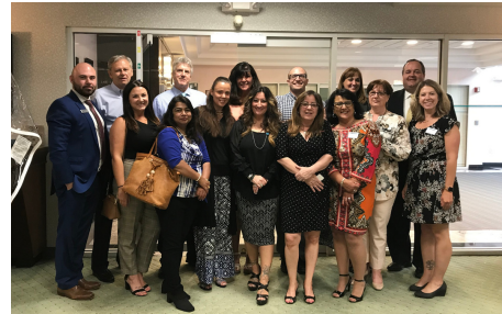
Pictured: Unity Bank of Clinton staff and Hunterdon County Chamber staff

The Unity Bank June Card Club gathered 50 businesses and organizations for an opportunity to make new connections. Chamber and Clinton Guild members came together for a casual evening of socializing.