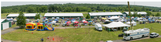
Pictured: Aerial view of the layout of Hunterdon Community Day

The execution and organization of the day is led by a dedicated group of volunteers who serve on the planning committee for this event. It would not be possible without their help.