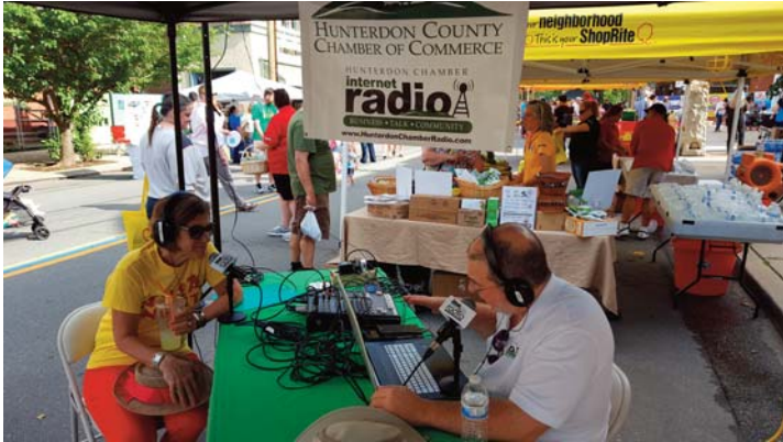
Hunterdon Chamber Radio will be back for a Live Remote from Salsa Night

The Hunterdon County Chamber of Commerce Is Proud To Be a Sponsor