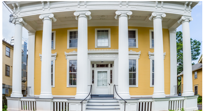
Above: The Chamber Offices are located in the Large House at 119 Main Street Flemington.