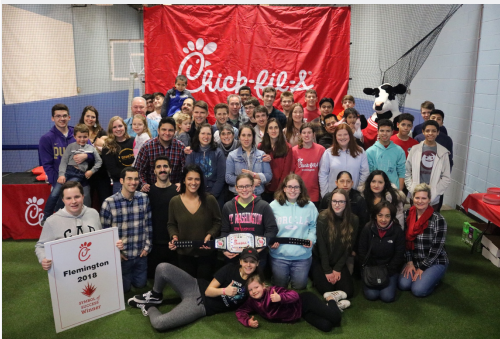
Chick-fil-A Flemington celebrating their accomplishment of being named a 2018 Symbol of Success

The MaxChallenge of Flemington recently hosted 'Workout for a Cause' to benefit Hunterdon Helpline . They also conducted a Silent Auction with proceeds going to Hunterdon Helpline! Great to see partnerships in the community!