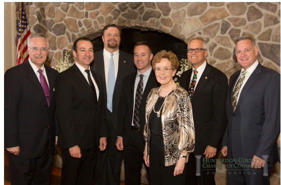
2017 Inaugural Class Hunterdon County Business Hall of Fame Inductees