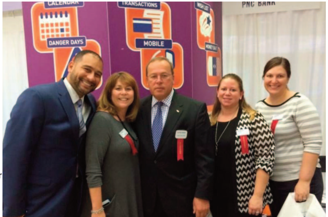
PNC BANK at the Hunterdon Business Expo - Presenting Sponsor

The Food Showcase will be returning this year. The popular showcase will take place from